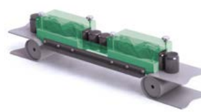
2 × 180° Turning station

For installation on a continuous conveyor belt.